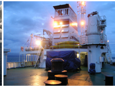
Marina Svetaeva Deck

Meals can be enjoyed in the pleasant dining room. Breakfast and lunch served in buffet form, whilst evening meals are more formal in their presentation. All dining experiences are accompanied by the ship's attentive stewardesses and Adventure Concierges, who endeavour provide excellent service. A live streaming video from the bridge can be watched on a television screen during meals to help keep passengers up-to-date with the ship's progress.