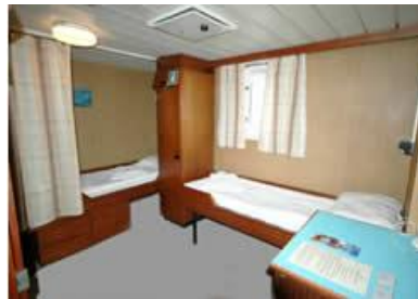
Twin Private Cabin