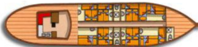
Lower Deck - Cabin Accommodation, Showers, Toilets