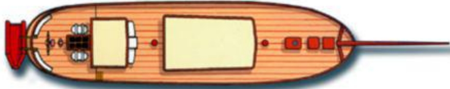
Top Deck View - Sun Deck, Back Deck Lounge, Deck Shower