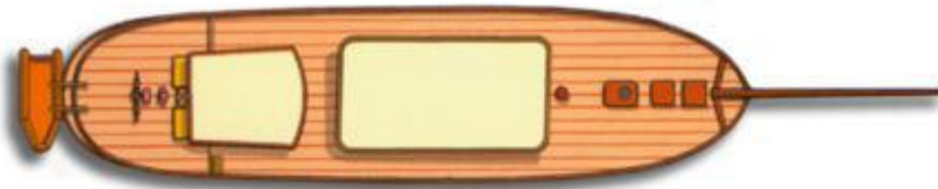
Top Deck View - Sun Deck, Back Deck Lounge, Deck Shower