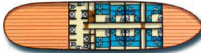
Lower Deck - Cabin Accommodation, Showers, Toilets